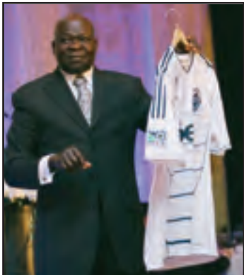
Many Doormen kindly helped display items for the Live Auction. Thanks guys!