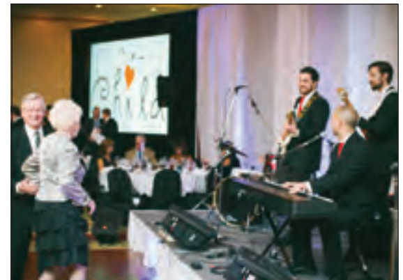
Band "Penelope Above" gets the dance floor moving as they supply the end of evening entertainment!